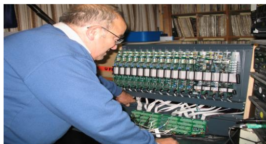
(Les under the bonnet of

A CBF General Grant provided funding to purchase a new 500w transmitter, which was installed at Mt Worth. An application in 2004 for a grant to provide a multi-directional antenna was unsuccessful, but a further application in 2005 provided the necessary funds. CBF also funded a battery back-up system for the main transmitter site, and items of transmission equipment. Each year, we have claimed a subsidy for transmission operating costs, including site rental at Mt Worth and part reimbursement of power costs. CBF Funding has also provided equipment for a CBAA satellite connection, a logging computer, and a Digital Delivery Network computer. Emergency and overnight programs have been automated through a computer program. Our production studio desk was provided by funds from CBF, supplemented by Bendigo Bank.