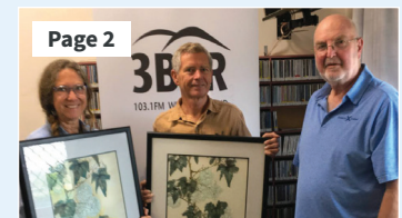
Art Raffle winner