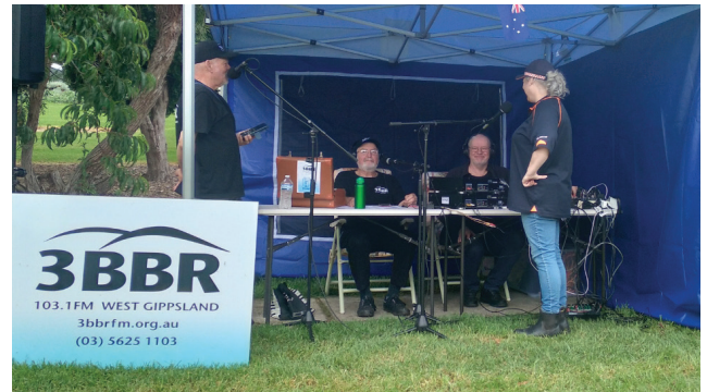
'Rock Archives' was broadcast live from Civic Park, Drouin as part of the Australia Day celebrations.

We were thrilled to be a part of the Australia Day event held at Civic Park, Drouin. Organized by Drouin Rotary, local community organizations came together to celebrate Australia Day in style. From lively discussions to groovy tunes, our broadcast was buzzing with energy and community spirit.