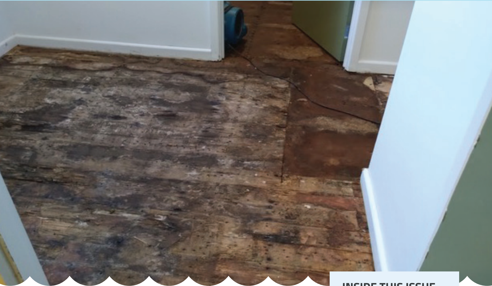
Damage to the 3BBR studio building following flooding.