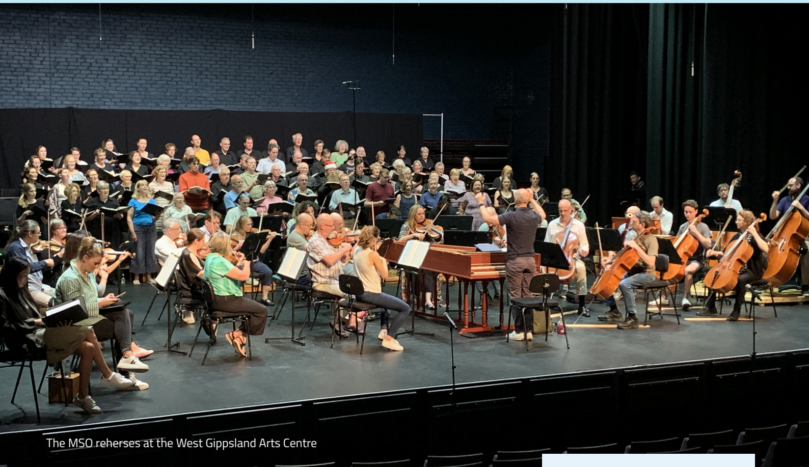
The MSO rehearses at the West Gippsland Arts Centre