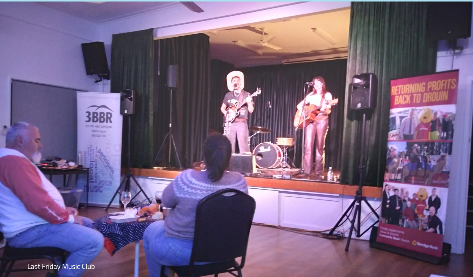
Last Friday Music Club