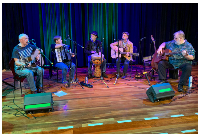
Mollimor at Wesley of Warragul, 31 May 2025